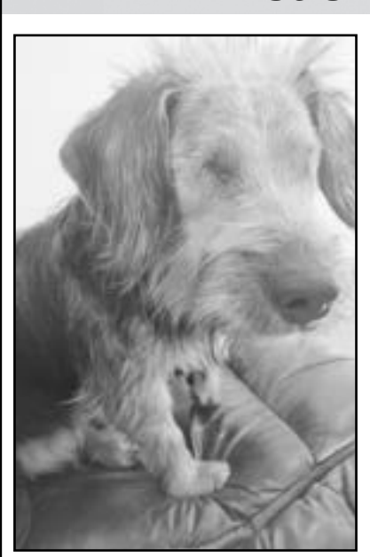
Cannon County Community for Animals